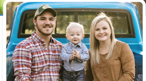
Affordable family care from Mississippi physicians